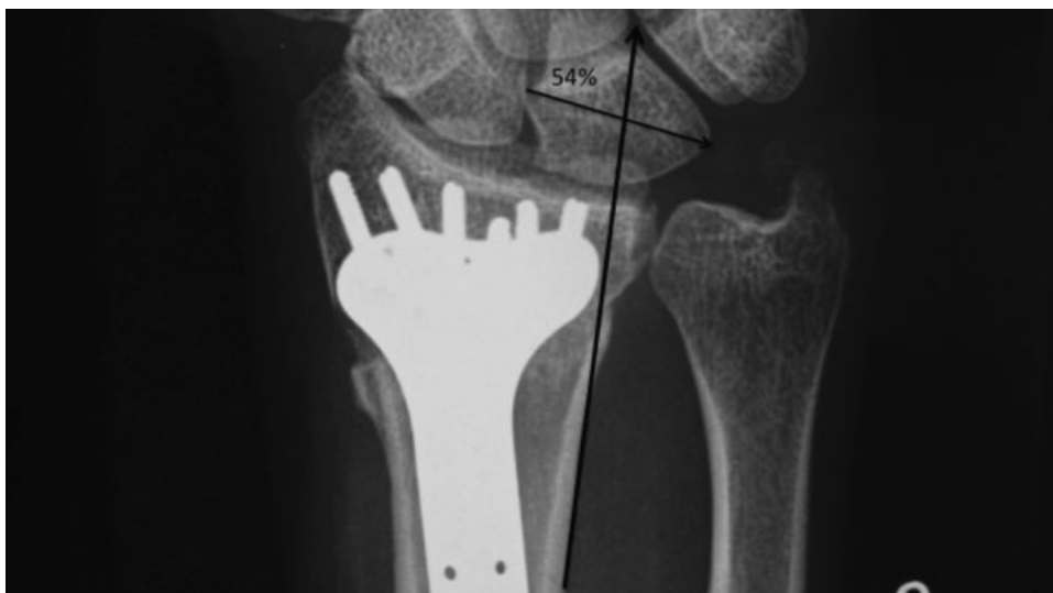
Fig. 3 Radial translation osteotomy for DRUJ instability with successful stability achieved with no ulnar-sided procedure.

radial side of the lunate to determine the percentage of lunate radial to this point (► Fig. 4 ).