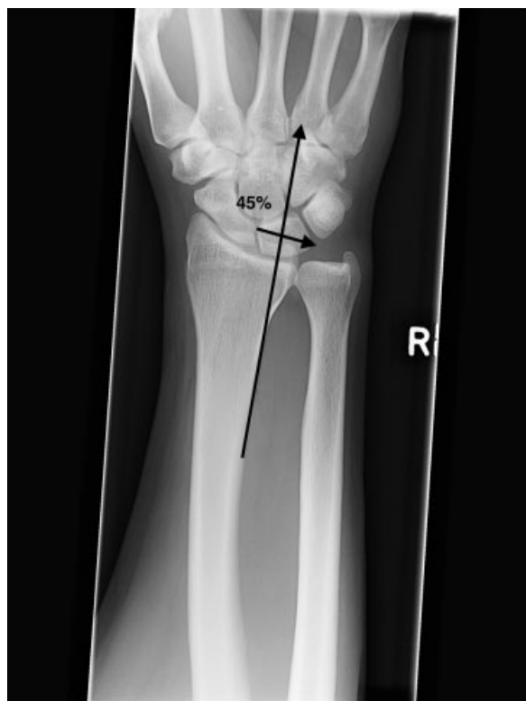
Fig. 4 A line is drawn parallel to the ulnar aspect of the radius proximal to the metaphyseal flare and extrapolated distally into the proximal row of the carpus. The point of intersection within the lunate is evaluated by drawing a second line along the transverse width of the lunate on the AP radiograph that is parallel with the distal radial articulation. The percentage of lunate radial to this line is calculated.

trained orthopedic surgeons with an interest in wrist surgery. Each of these surgeons reviewed 25 radiographs to calculate the inter-rater reliability of this parameter. Single-measure intraobserver and interobserver reliability were assessed using the intraclass correlation coefficient (ICC) calculations using a two-way random effects model for absolute agreement (i.e., systematic differences between raters are considered relevant). We used 95% confidence intervals (CI). ICC values were interpreted as: >0.75 was excellent or high level of agreement, 0.40–0.75 was fair to good level of agreement, and <0.40 was considered poor. 11 Statistical analysis, including ICC calculations, computed with SPSS Version 21.